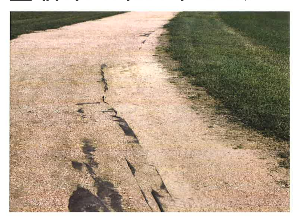
ITEM 1: Jogging trail geotextile damaged and crushed granite washed away.