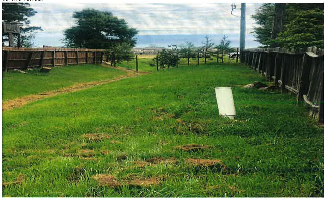
Debris stacked on the east side of the channel.

Before - View looking north toward the pond. Note tree trunk debris on both sides of the channel next to the fence.